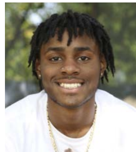
Angelo Walton Trade School/ Entering the Workforce