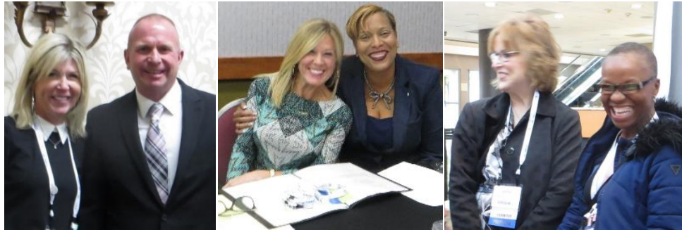
ABOVE, left to right: