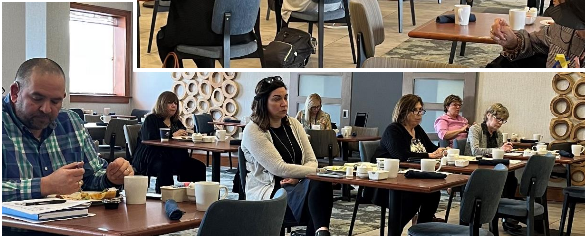
ABOVE & RIGHT: Some of the participants in the April 13 meeting.