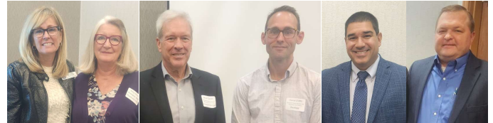
Presenters and participants in the October 2022 fiscal conference.