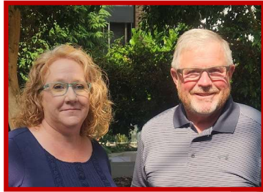
2022-2023 Information Exchange Committee Presenters & Members