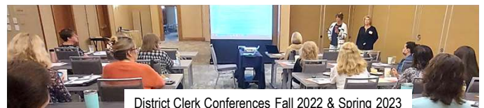
District Clerk Conferences Fall 2022 & Spring 2023