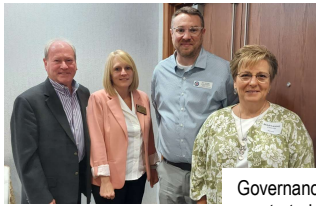
Governance seminar for board members whose term started July 2022: Presenters and participants.

This year the Association hosted governance and finance conferences for new board members, two law conferences, and a seminar for prospective school board members. In addition, MCSBA presented three district clerks' professional development seminars.