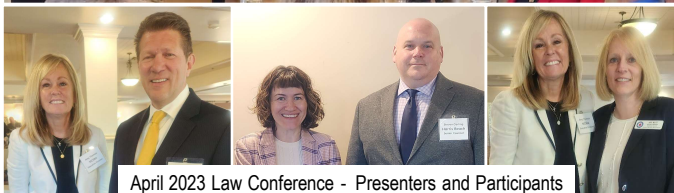
April 2023 Law Conference - Presenters and Participants