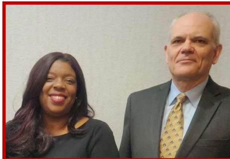
2022-2023 Labor Relations Committee Presenters & Members