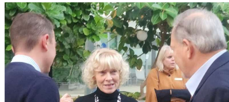
Members at the November and May social networking events.