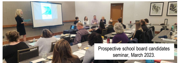
Prospective school board candidates seminar, March 2023.