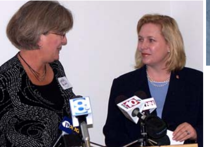
ABOVE: NYS Senator Joseph

about federal education initiatives and to meet with lawmakers. Members also met with Congress members and their staff members in their local offices.