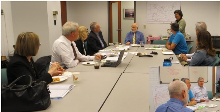
Left and Below: MCEC members debrief after spring visits to local legislative offices.

The coalition plans to meet with Federal legislators in the summer to highlight policy and legislative changes at the Federal level that could result in education funding and program reductions at the local level.