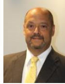
East Irondequoit CSD Board of Education Member and Past Board President Past MCSBA Labor Relations Co- Chair