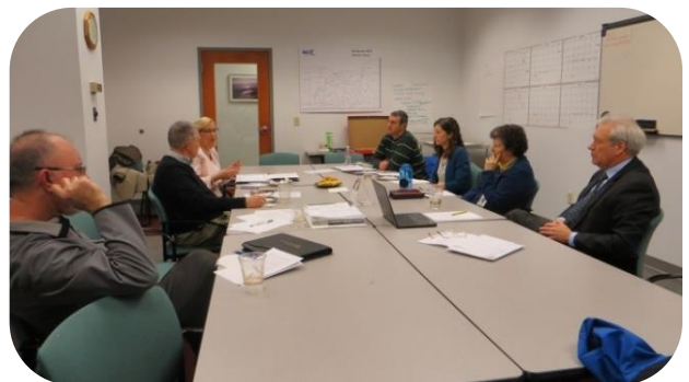
MCEC members work to identify advocacy priorities.