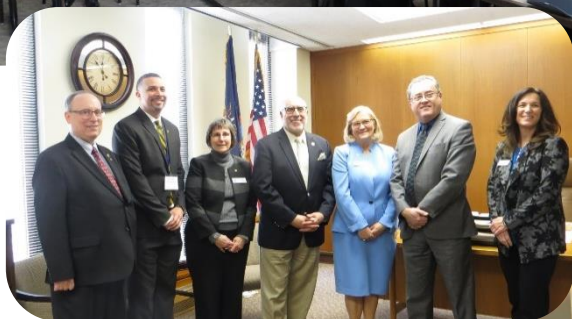
Right Legislative Sub-committee members work to up-date the position paper on the Federal role in public education.