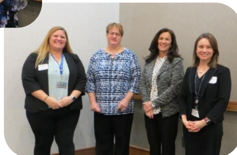
Cultivating Life Long Readers in the 21st Century