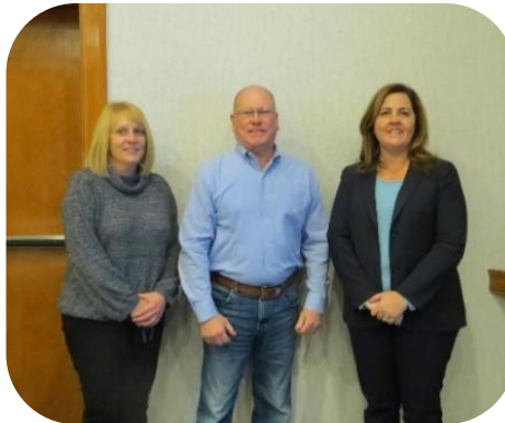
Negotiations 101.... Strategies & Your Role as a Board Member