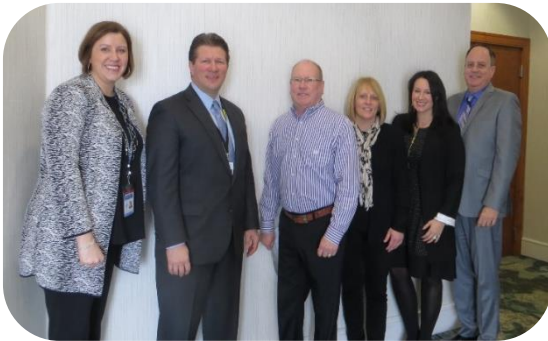
Staff Recruitment Avenues