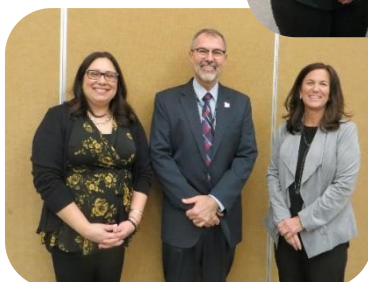
National Center for Missing and Exploited Children