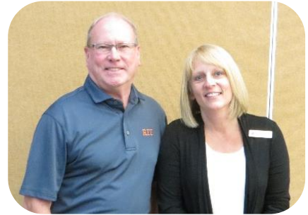
Developing Leadership Capacity