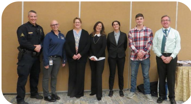
JUULing and E-Cigarettes & Your Students Health