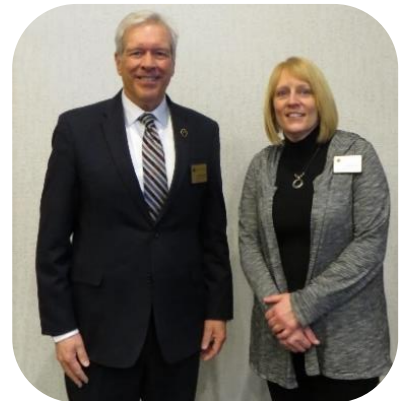
Reserves – What Every Board Member Should Understand