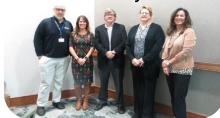
Partnering to Support Restorative Practices in Schools