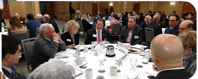
Above: U.S. Congressman Morelle met with members at the MCSBA Legislative Breakfast in February.