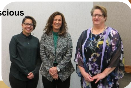
Taking the Unconscious Out of Bias