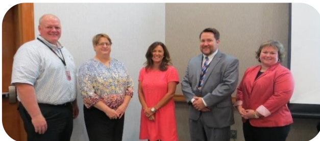
Using the Youth Risk Behavior Survey to Improve Student Well Being