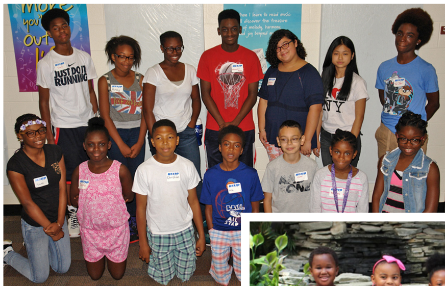
East Rochester Central School District