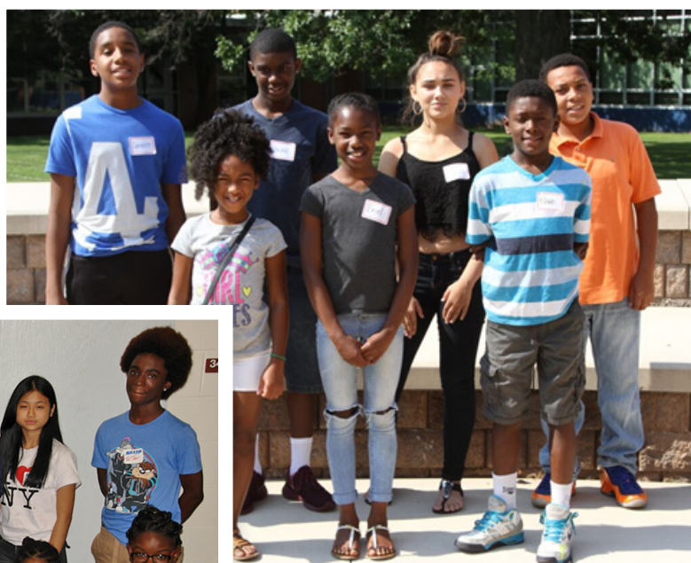
East Irondequoit Central School District