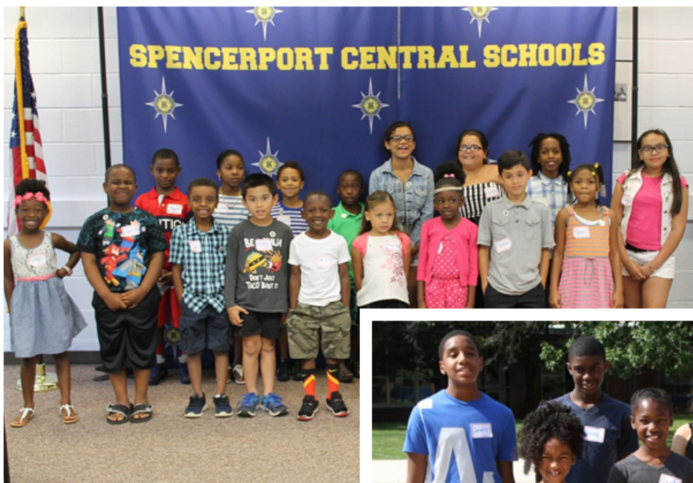
Spencerport Central School District