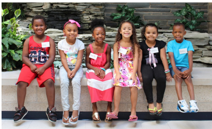
Hilton Central School District