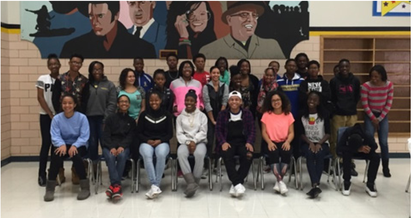
Irondequoit High School