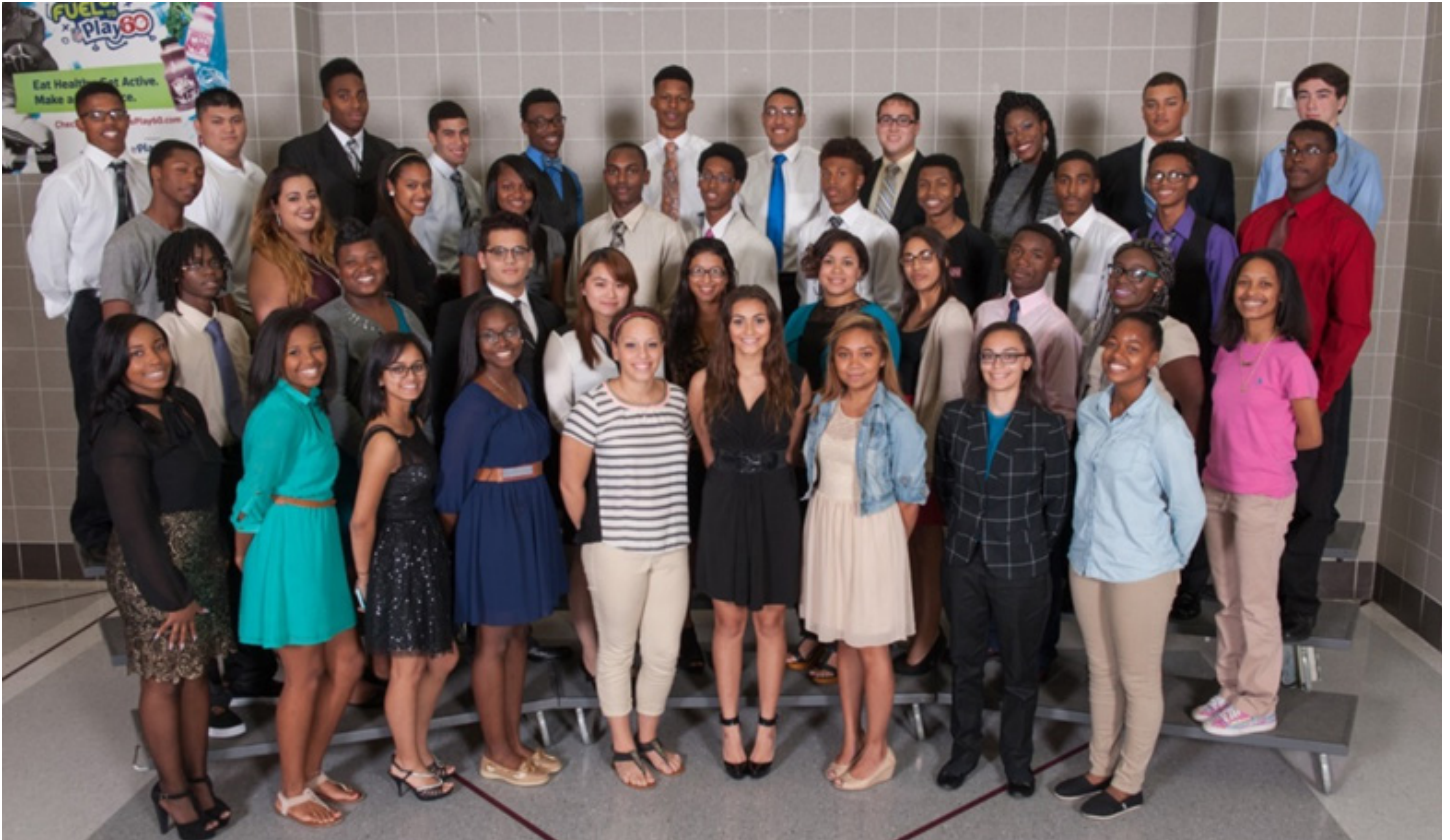
Class of 2016

Senior Night provides important information for students and parents on college admissions and the Urban-Suburban scholarship application process. The evening featured a panel of Urban-Suburban Alumni who shared their experiences and spoke on topics including HEOP/Financial Aid, Historically Black Colleges and Universities (HBCU's) and the pro's and con's of attending SUNY colleges vs. private colleges.