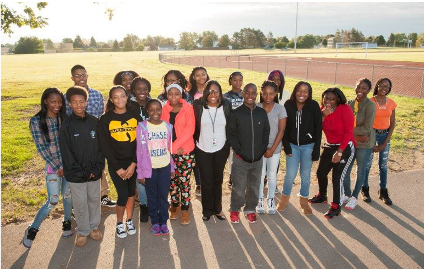
Wheatland-Chili Middle School/High School