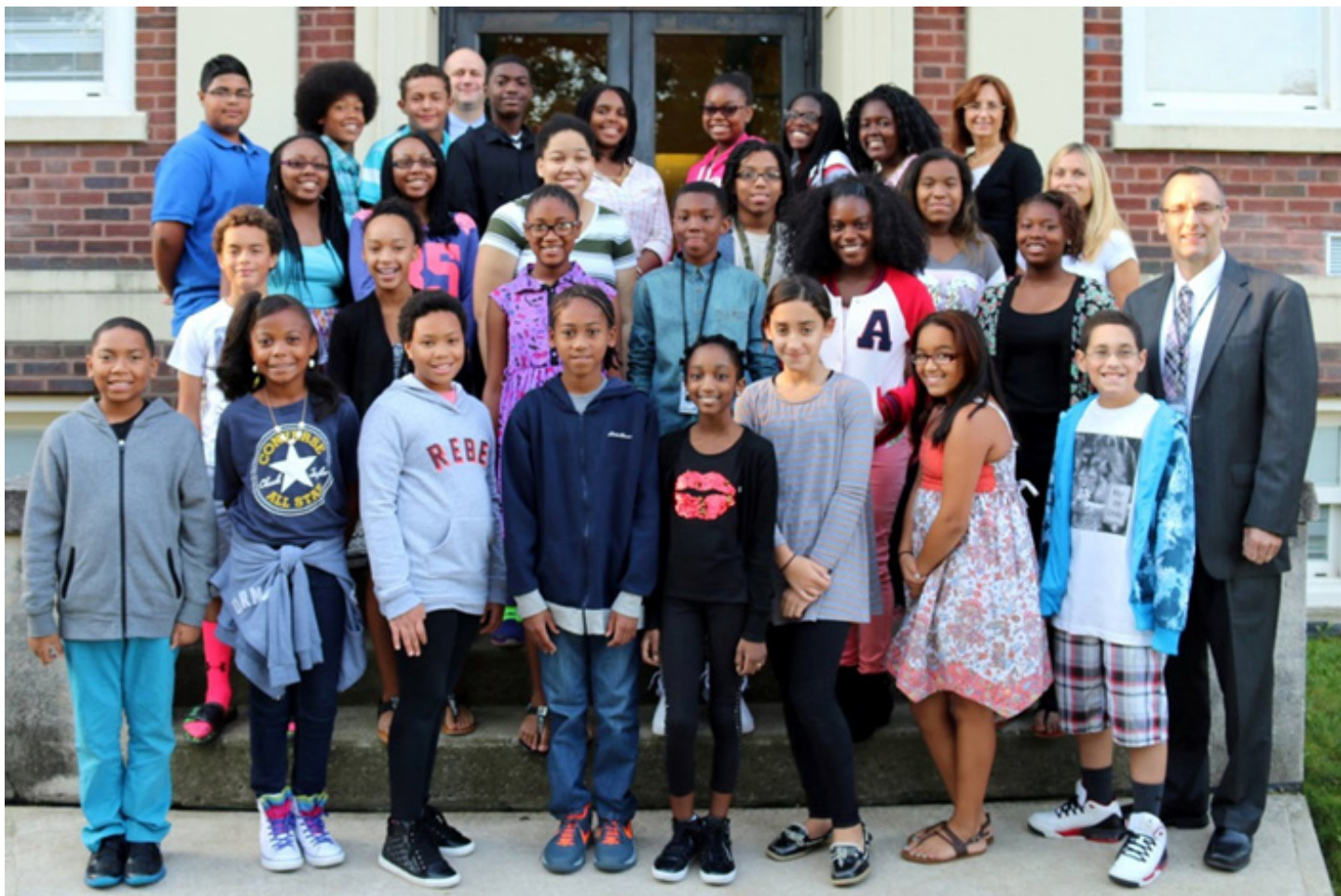
Brighton's Twelve Corners Middle School