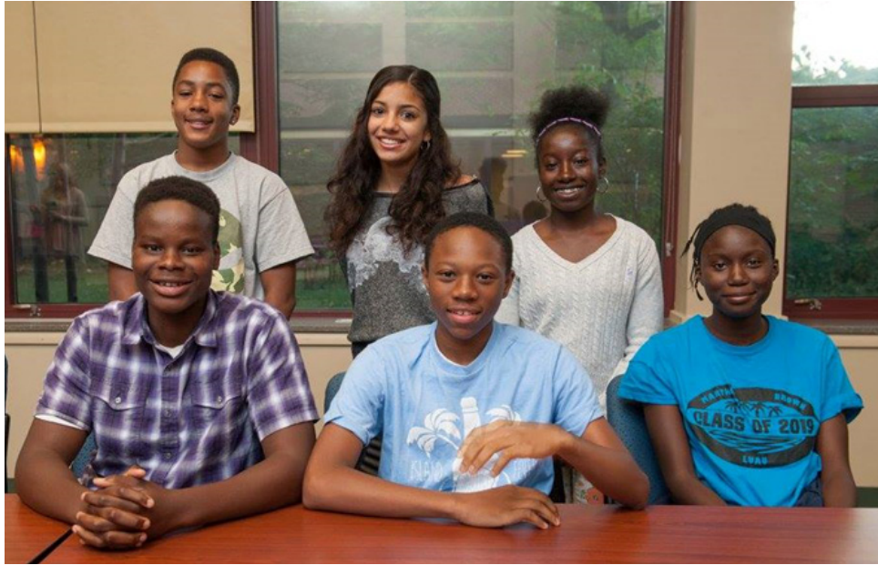
Fairport's Minerva Deland Ninth Grade Academy