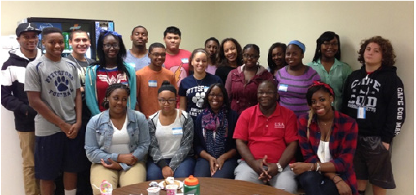
Pittsford Mendon High School