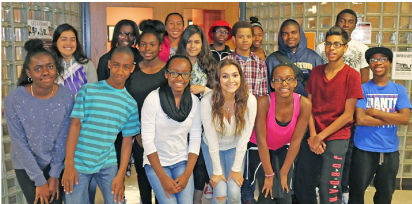
Brighton High School