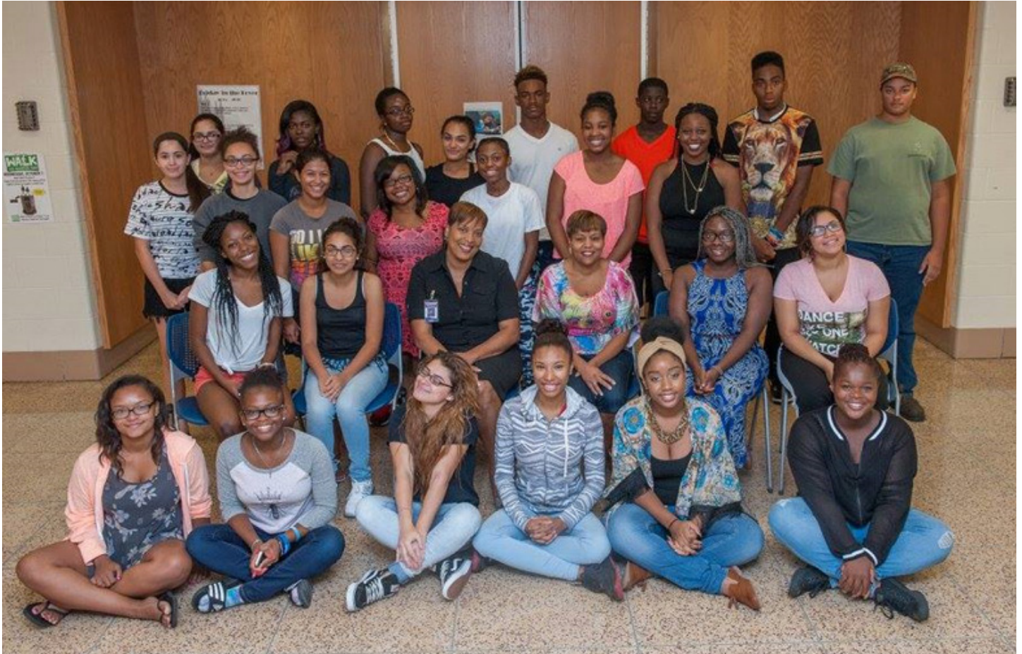
Brockport High School