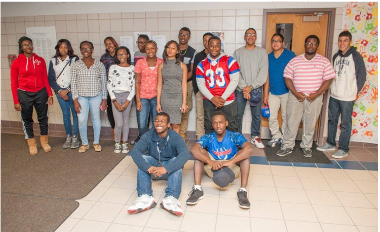
Fairport High School