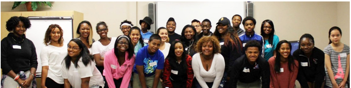
Penfield High School