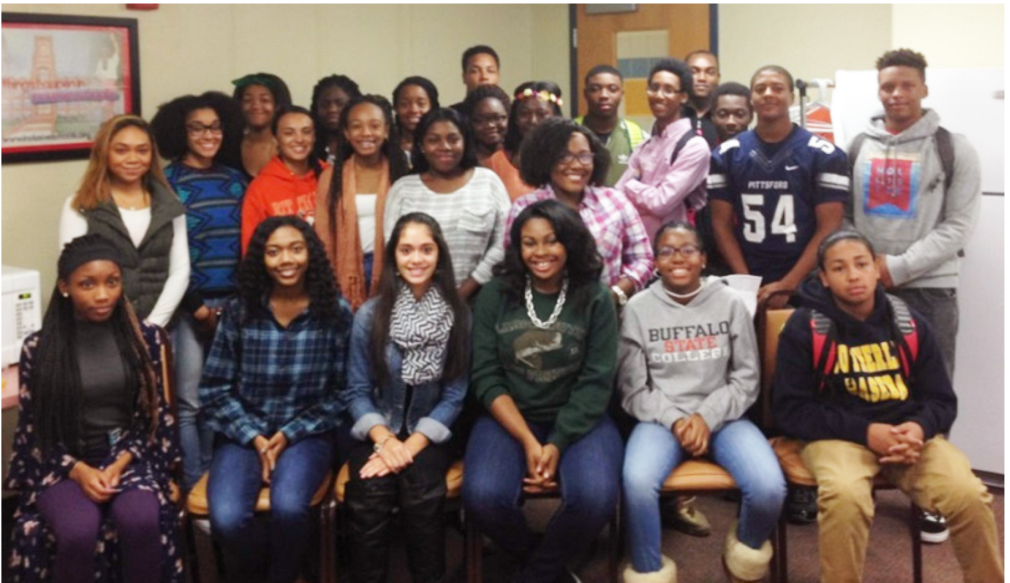
Pittsford Sutherland High School