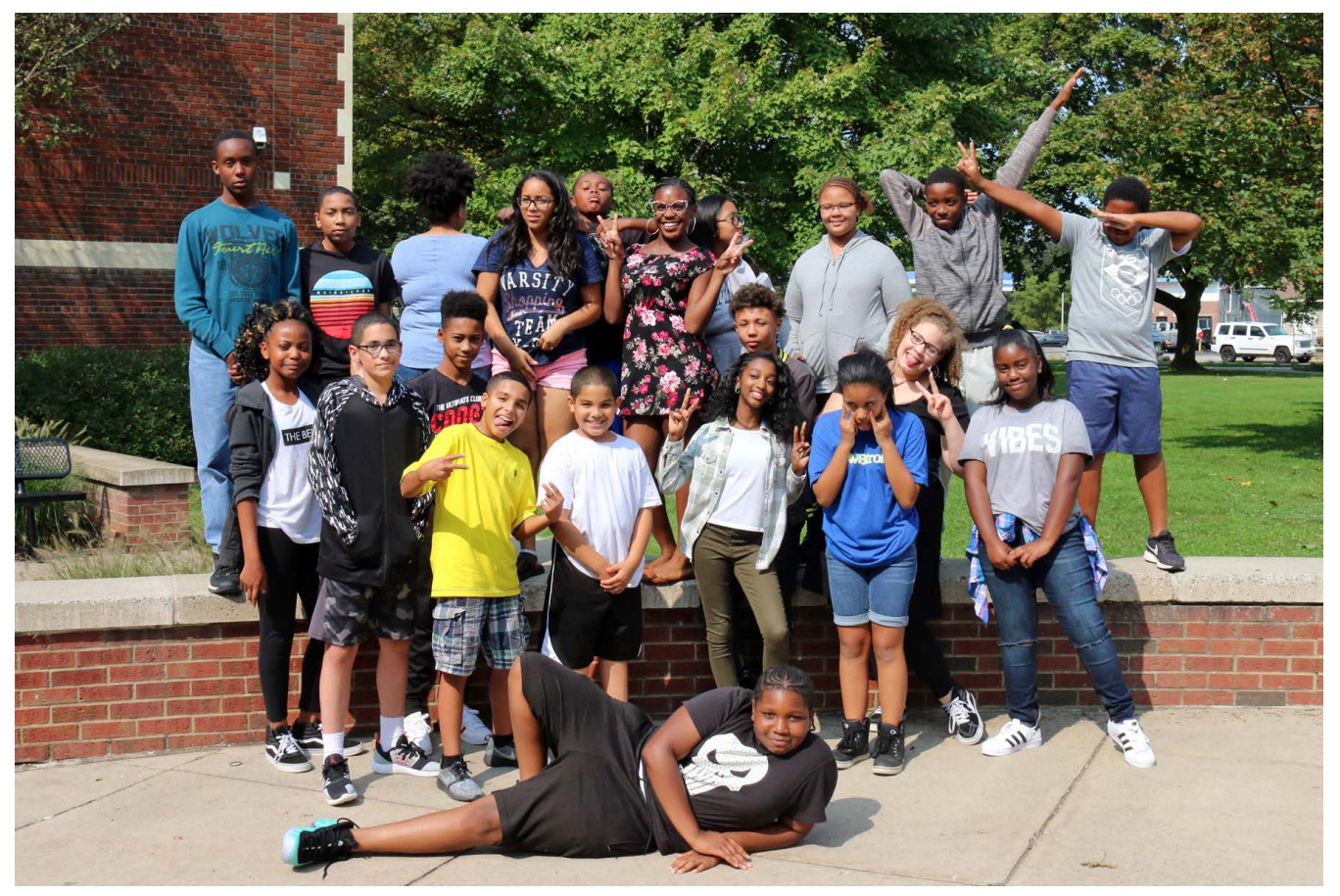
Twelve Corners Middle School