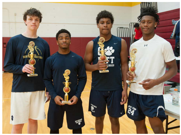
2017 High School Tournament Champions