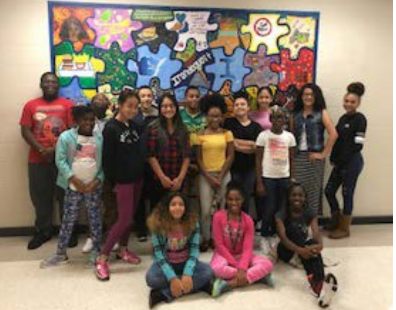
East Irondequoit Middle School