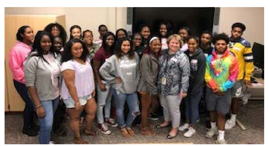
Penfield High School

During September and October, some of our participating schools held Back-to-School events for their Urban-Suburban students. These events kicked-off the beginning of the school year and allowed the students across grade levels to interact with one another, school personnel, and Urban-Suburban staff. Pictures from these events can be seen on these next few pages.