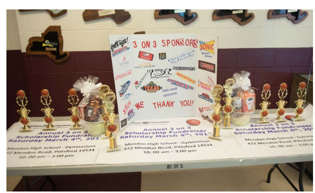
2017 Tournament Sponsors