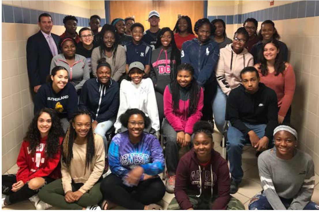
Sutherland High School