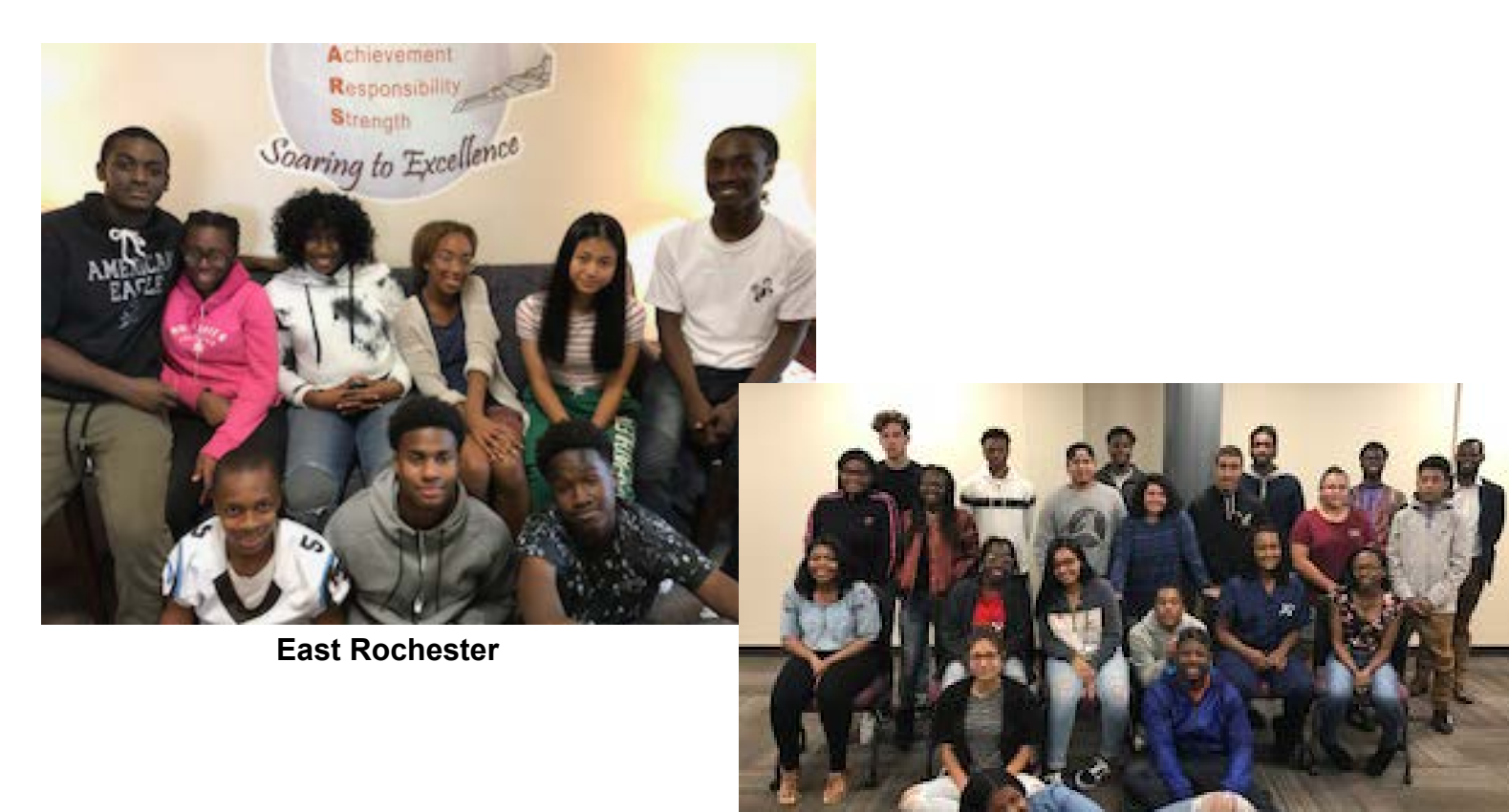
Fairport High School