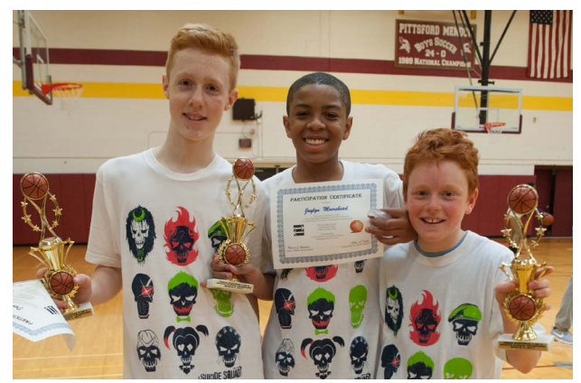
2017 Middle School Tournament Champions