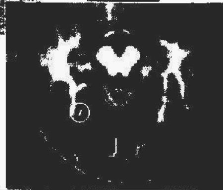
► In children who had practiced writing by hand, the scans showed heightened brain activity in a key area, circled on the image at right, indicating learning took place.